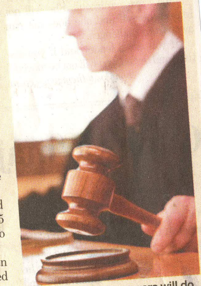
JAIL: Two mine managers will do time for demanding kickbacks.

She said the direct imprisonment sentence sent a warning to those